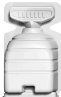
Stable foldable base